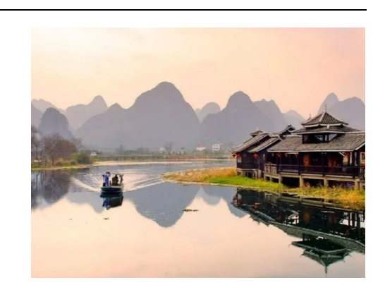
Extended due to popular demand!

Experience the highlights of China with this land and air package!