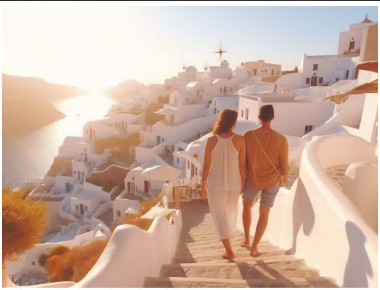
8 Nights of Accommodation with Upgrades Available

From $2,499 Typically $2,999 pp twin share